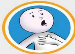
Difficulty in breathing