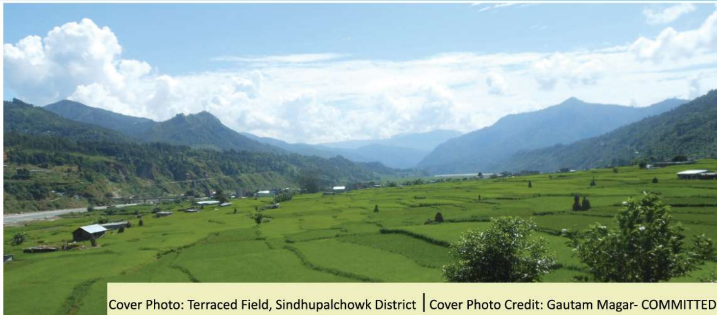
Cover Photo: Terraced Field, Sindhupalchowk District