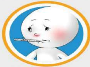
Fever (38°C and higher)